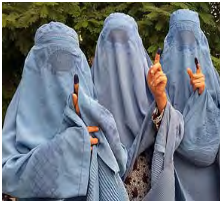
Women showing inked fingers after voting in Herat, June 14, 2014.

Officials from all three agencies reported that although the number of projects, programs, and initiatives specifically intended to benefit Afghan women will be consolidated after 2014, their efforts to support Afghan women will continue and, in some cases, the funding for these efforts will increase. However, the lack of agency-level assessments of the impact of these efforts to date, combined with ongoing challenges to implementing efforts to support Afghan women and with the U.S. government's expected reduced visibility over activities, will make it difficult for agency leaders and the Congress to understand and make decisions on future programs and funding in support of Afghan women.